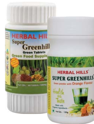
Super Greenhills Powder & Tablets